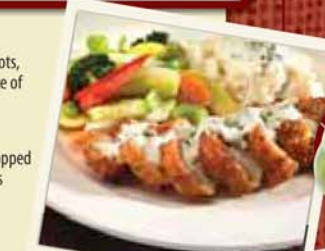
Chicken Cordon Bleu

Tender chunks of steak braised with mushrooms prepared in traditional sour cream and gravy sauce and tossed with flavorful noodles. $9.99