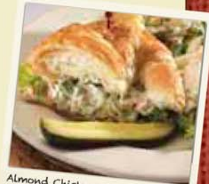
Almond Chicken Croissant

Roast beef, piled on a Filone roll with onions, mushrooms and Swiss cheese. Served with au jus. $8.99