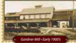
Gardner Mill - Early 1900's

The most popular of the dining areas is the 32 ft. concrete silo, built in approximately 1905, and used to hold 1.2 million pounds of dry wheat from local farms. On the main level, 9 booths line the walls, each dedicated to one of Gardner's 11 wives. Descendants often request seating with their great grandmother!