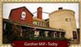
Gardner Mill - Today