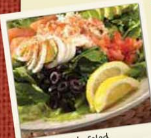
Krab & Avocado Salad

Served with fresh sourdough bread. Cup $2.99 • Bowl $4.29