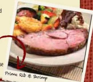
Prime Rib & Shrimp

*Baked potatoes served after 4 pm. Load your potato with bacon and cheese for 99c.