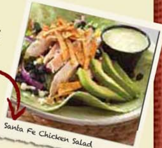
Santa Fe Chicken Salad

Romaine lettuce tossed with diced tomatoes, corn and black beans. Topped with grilled chicken, avocado and seasoned tortilla strips. Served with avocado ranch dressing. $9.99