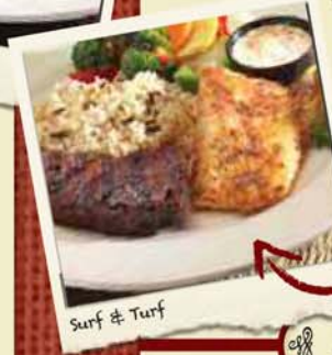
Surf & Turf